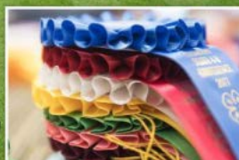
Colorado 4-H Welcomes Members and Volunteers!