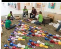
Colorado 4-H State Conference Begins